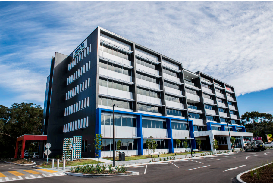
Mariners Centre of Excellence, North Construction and Building, winner Commercial Builder of the Year

The 22nd annual Excellence in Building Awards for Newcastle were held on Friday 9th September 2016