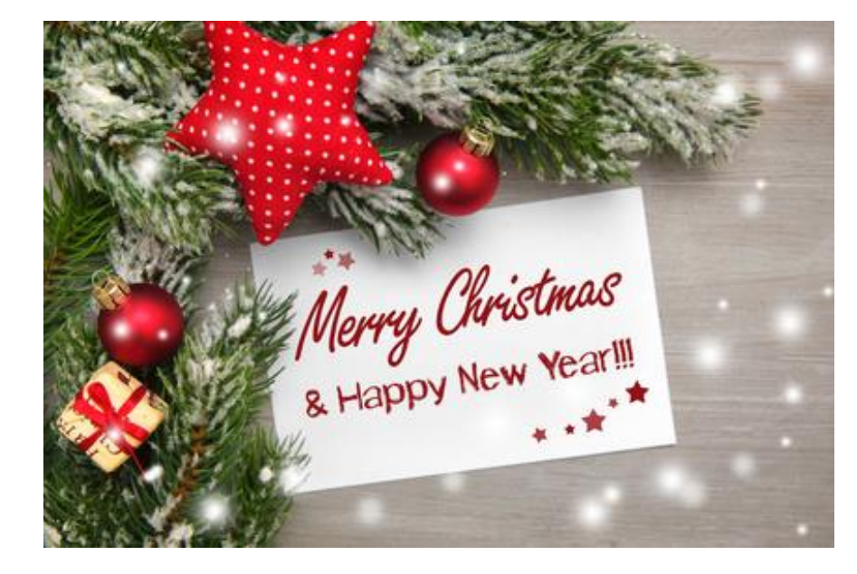
From the Team at MBA Group Training and Personnel I Have a safe and enjoyable festive season!

Our next Newsletter will be released in April 2017.