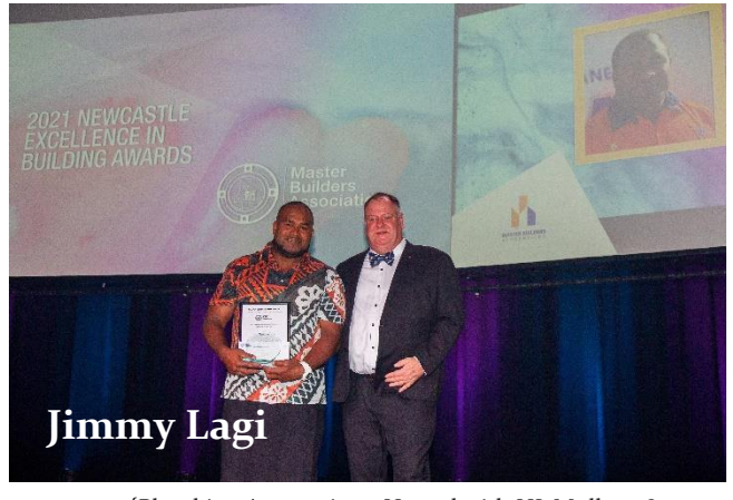
{Plumbing Apprentice - Hosted with HL Mullane & Son}